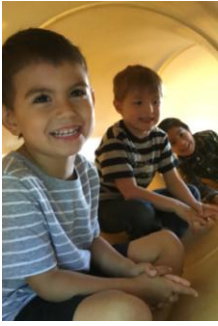
The boys just hangin' out :)