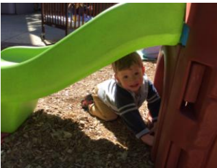
Love playing outside :)