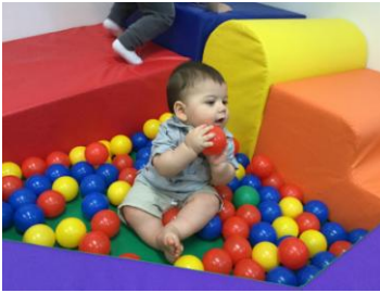
Playing in the ball pit

As May has come to an end, we are very excited to welcome June and the nice weather to come along with it.